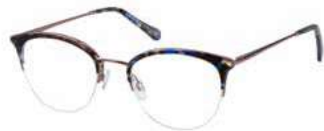
DANIA - 105