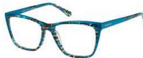
JANELLA - 188