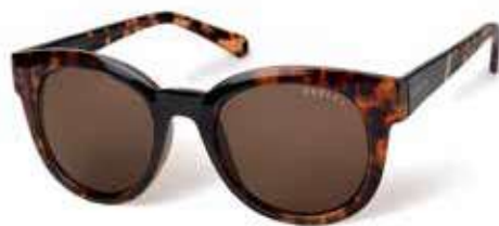
ELSPETH - 102