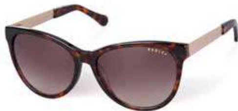
AMBER - 102