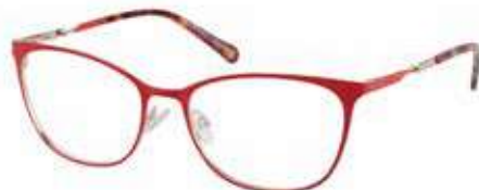
JANUARY - 260