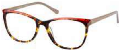
PORTIA - 102