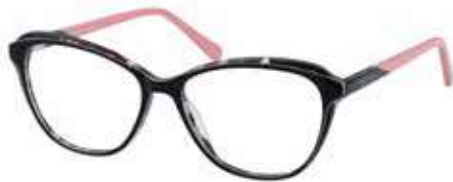
KADY - 104