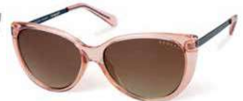
GENNA - 172

Gloss green crystal / Matte gray Solid green