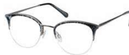
DANIA - 195

Shiny rose gold / Gloss rose horn / Gloss pink tort