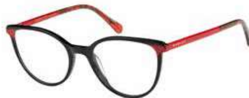
KAROLINA - 104