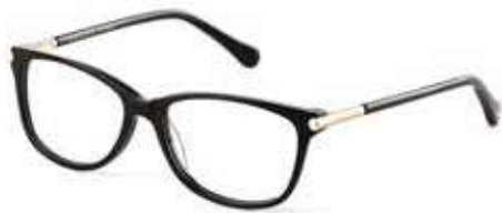
ROBYN - 104 Gloss Black / Matte Gold