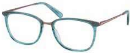
CALICO - 107