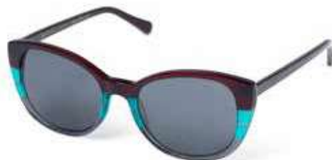
ANNA - 162

Gloss Burgundy / Grey / Green Solid smoke