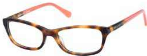
HENRIETTA - 102