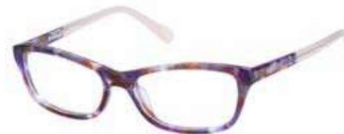
HENRIETTA - 161