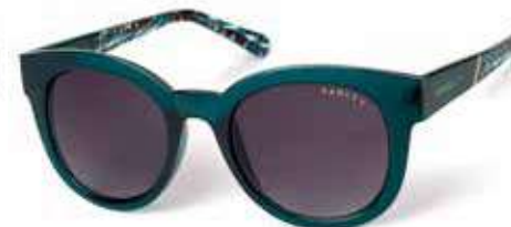
ELSPETH - 107