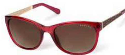
SASHA - 162

Gloss turquoise crystal / Grey - Shiny silver Solid smoke