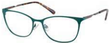
JANUARY - 207