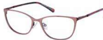
ALI - 272

Shiny rose gold / Sangria / Burgundy tort