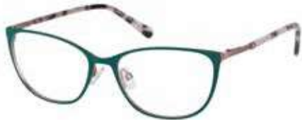
ALI - 207