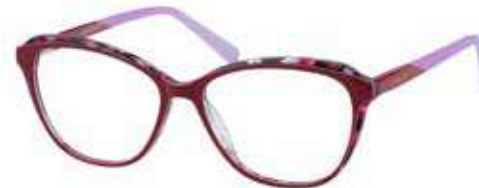
KADY - 162