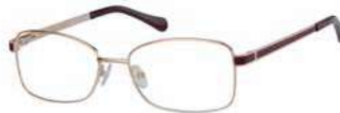
JAENA - 072