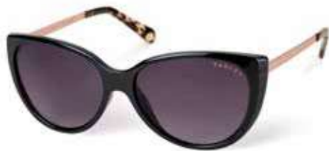
GENNA - 104

Gloss black / Tort - Rose gold Smoke grad