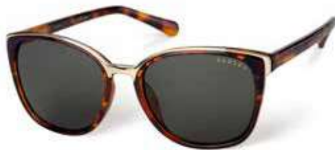
OTTOLINE - 102