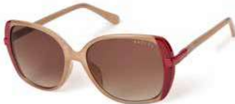
MORWENNA - 103

Gloss camel / Burgundy - Shiny gold Brown grad