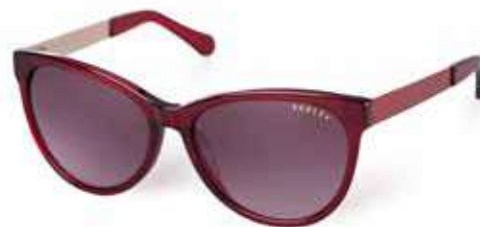
AMBER - 162