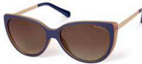
GENNA - 106

Gloss black / Tort - Rose gold Smoke grad