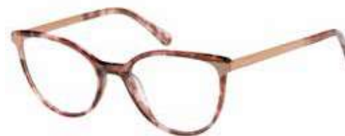
KAROLINA - 172