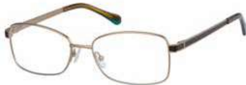
JAENA - 001