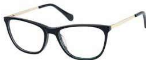
MARGARET - 104