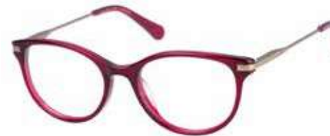
MARCIE - 162 Burgundy crystal / Rose gold