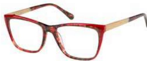
JANELLA - 160