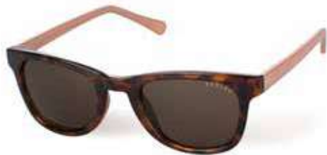
JENNIE - 102

Gloss black / Tort - Rose gold Smoke grad