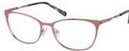
JANUARY - 272