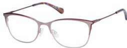
YOLANDE - 061 Matte rose gold / Purple