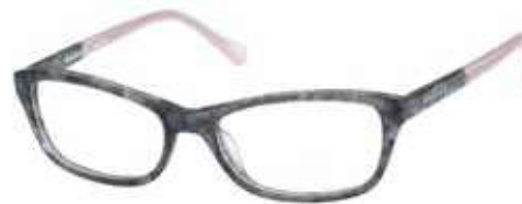
HENRIETTA - 104