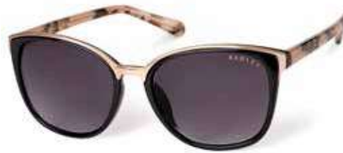
OTTOLINE - 104

Gloss black / Pink tort - Rose gold Smoke grad