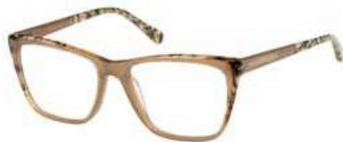
JANELLA - 103