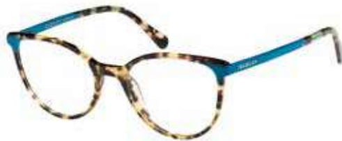
KAROLINA - 102