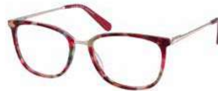
CALICO - 162