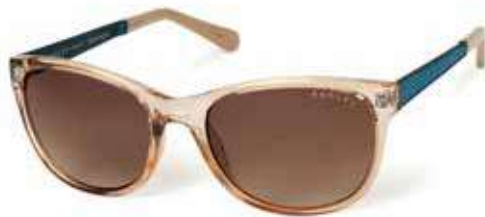
SASHA - 103

Gloss camel / Teal - Shiny gold Brown grad