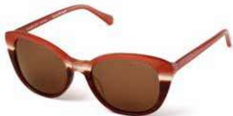
ANNA - 150