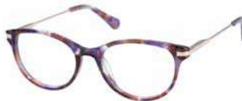
MARCIE - 161 Gloss purple tort / Gold