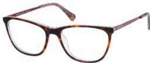
MARGARET - 102