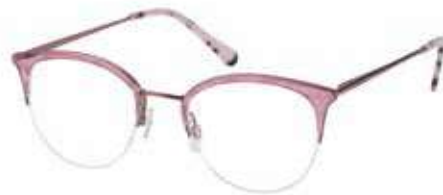
DANIA - 172

Shiny rose gold / Gloss rose horn / Gloss pink tort