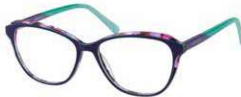
KADY - 161