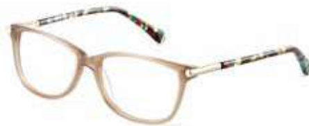
ROBYN - 107 Gloss Nude / Teal Floral Tort / Gold