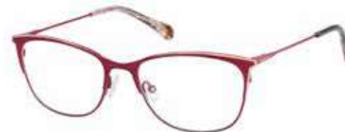
YOLANDE - 062 Matte Burgundy / Matte gold