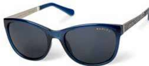
SASHA - 107

Gloss camel / Teal - Shiny gold Brown grad