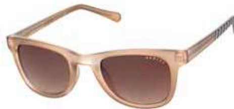
JENNIE - 118

Gloss black / Tort - Rose gold Smoke grad