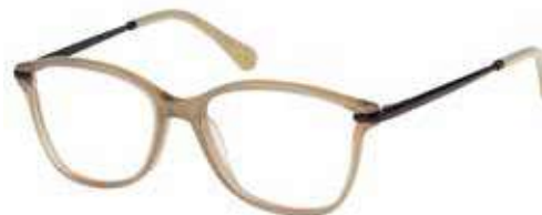
VANESSA - 103