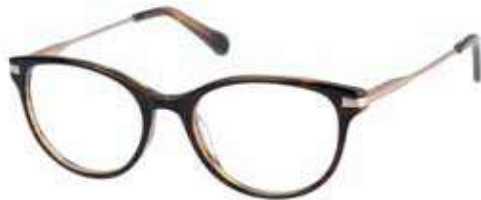
MARCIE - 102 Gloss brown horn / Gold