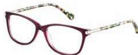
ROBYN - 161 Gloss Purple / Lilac floral / Satin Silver