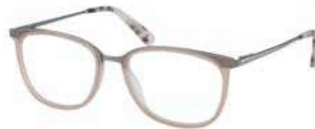
CALICO - 108