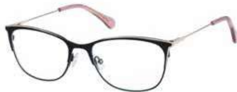
YOLANDE - 004 Matte black / Shiny gold