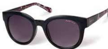
ELSPETH - 104