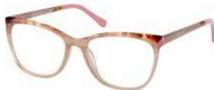
PORTIA - 118