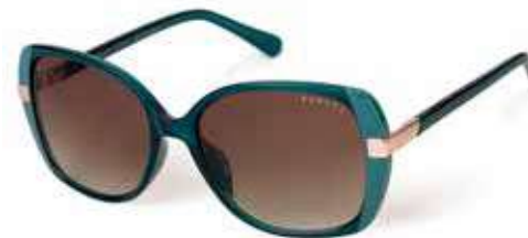
MORWENNA - 107

Gloss solid black / Shiny gold Smoke grad