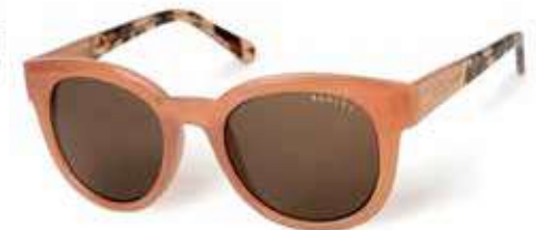
ELSPETH - 172