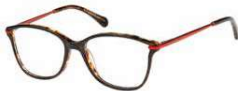
VANESSA - 102