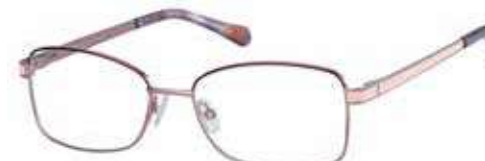
JAENA - 261