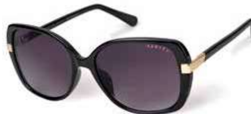
MORWENNA - 104

Gloss camel / Burgundy - Shiny gold Brown grad