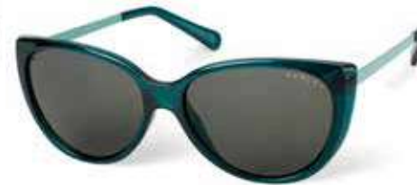
GENNA - 107

Gloss navy / Brown crystal - Shiny gold Brown grad