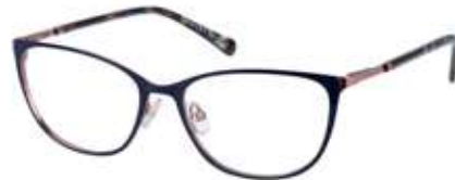
ALI - 261