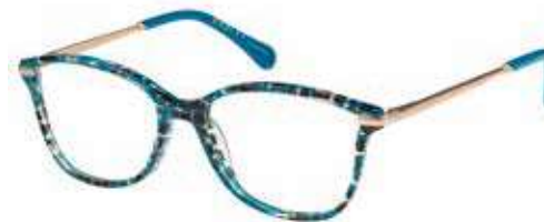
VANESSA - 188